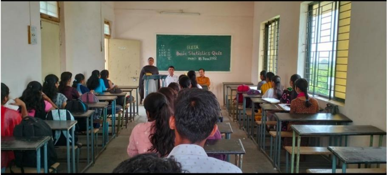
Photo and news in newspaper.